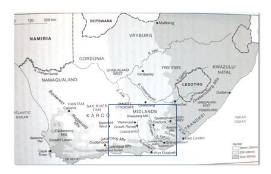
Main area of prickly pear invasion in the Cape

cloning from cladodes. If reproduced from seed, most spineless plants reverted to thorny varieties. This was the general pattern as prickly pear became invasive in the second half of the nineteenth century. By the later decades of the nineteenth century, sweet, wild fruits – abundant in many central and eastern Cape districts - were collected free and widely eaten by people, both black and white. Some were sold to the towns. Prickly pear fruit beer became a favoured beverage for poor black people in districts where the plants thrived. The plant was also used for yeast, syrup and soap. Local knowledge and culture was expanded around an exotic.