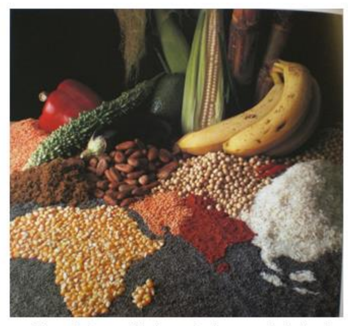
Map of the world through characteristic foods

Maize brought in its wake ecological and increasingly agro-ecological disadvantages. It displaced indigenous species where land was cleared. Monocropping gradually displaced mixed fields with beans and pumpkins. Maize cultivation prepares ground for weeds, can quickly exhaust soil and precipitate soil erosion. McCann (2005) argued that maize spread malaria – at least in Ethiopia, where this crop is gradually expanding its frontiers.