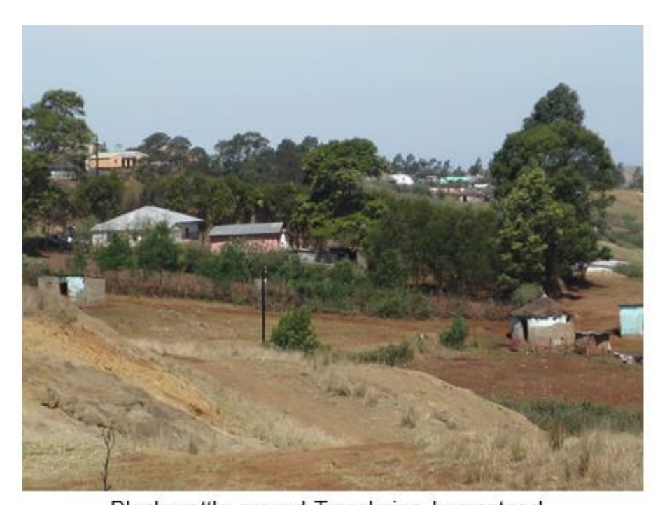
Black wattle around Transkeian homestead

African smallholders on communal lands planted black wattle around their homesteads as a quick-growing source of timber, fuel and shade in higher rainfall districts east of the Drakensberg. It was resistant to fire, could be pollarded, and also spread itself, diminishing the need for systematic planting. Black wattle was at one time ubiquitous as a household agroforestry crop in parts of the Eastern Cape, KwaZulu-Natal and Mpumalanga. No calculation has been made of the scale of smallholder tree stocks but by the end of the twentieth century plantations covered about 130,000 ha. and an estimated 2.5 million ha had been partially invaded (de Wit et al, 2001). Black wattle is interesting for the same reasons as prickly pear – it creates havoc around our categories and is, in the words of scientists, a 'conflict of interest' species. It has attracted academic analysis in South Africa and is one of the few species for which a systematic cost benefit analysis has been attempted.